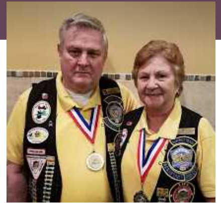
2018-2019 COY Assistant District Directors